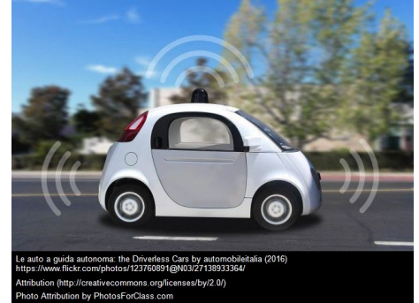
Le auto a guida autonoma, the Driverless Cars (2016)

Online shopping: I'm mad at this form of technology, and at the same time, I like it. I'm mad because it made Toys R Us go out of business. The reason I like it is because you don't need to go to the store anymore, you can just buy it online. It is so easy. You can buy something with just the click of a button and it will be delivered to your house.