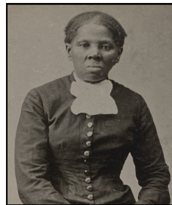
A former slave, Harriet Tubman was an abolitionist.